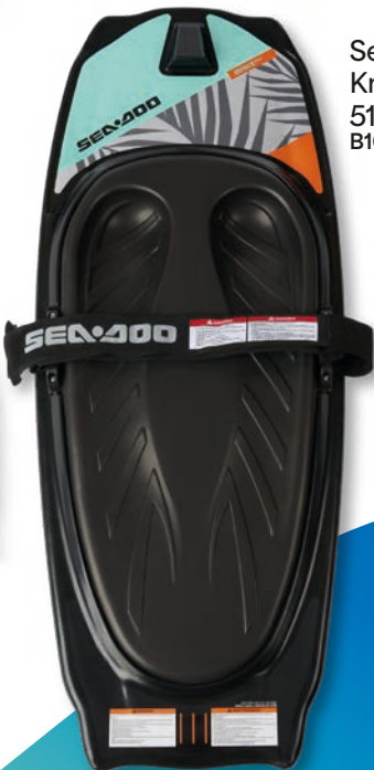
Sea-Doo Kneeboard 51.5 in./131 cm B107510076