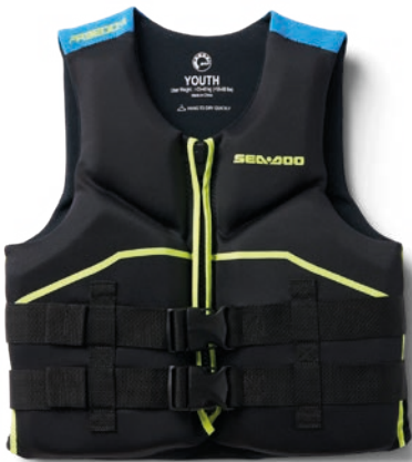
Sea-Doo Junior Freedom PFD 285972_90 (US/CA) 285973_90 (EU)