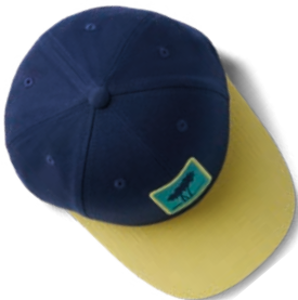
Youth Palm Curved Cap 288217_89