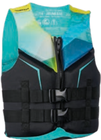
Junior Freedom PFD 287030_90 (US/CA)