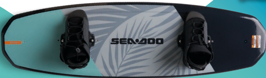
Sea-Doo Wakeboard 55 in./140 cm B107520076