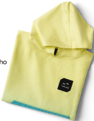
Kid's Sea-Doo Quick Dry Poncho by Slowtide 288061_76