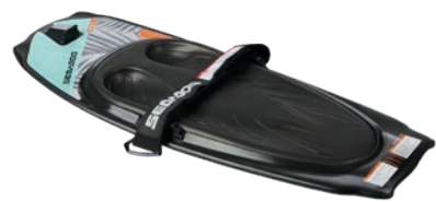
Turquoise (Aqua) (76)