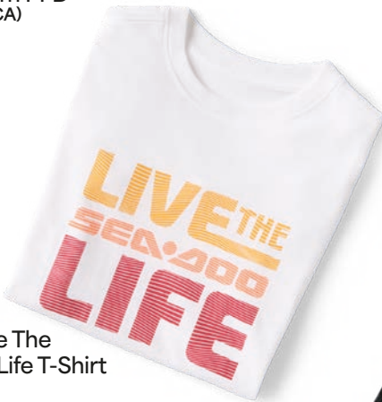
Youth Live The Sea-Doo Life T-Shirt 288373_01