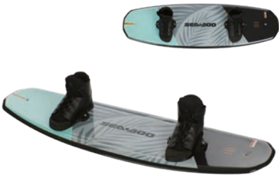
Turquoise (Aqua) (76)